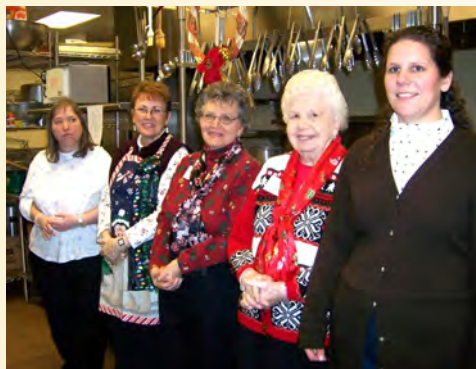
Holiday Fair 2009