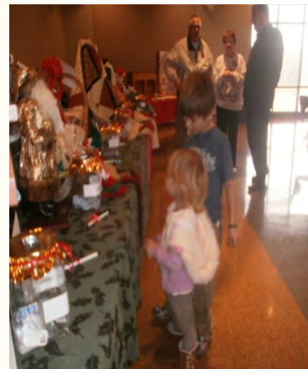
St. Nicholas Fair 2011