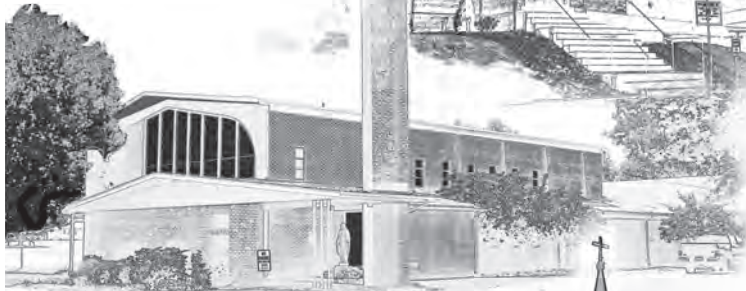
SAINT MARY CHURCH Hamilton