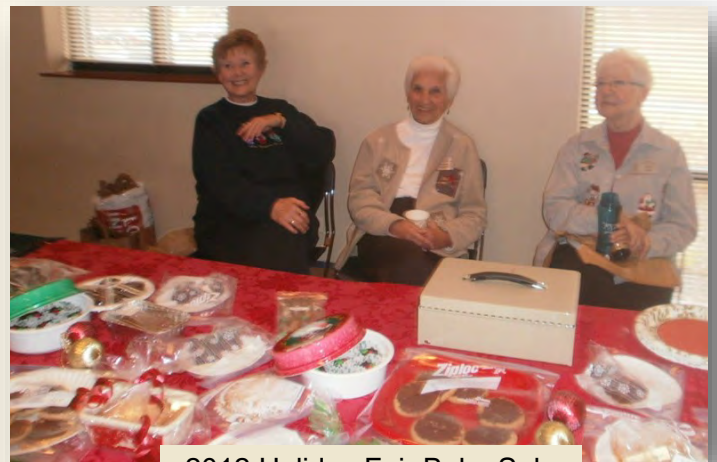
2012 Holiday Fair Bake Sale