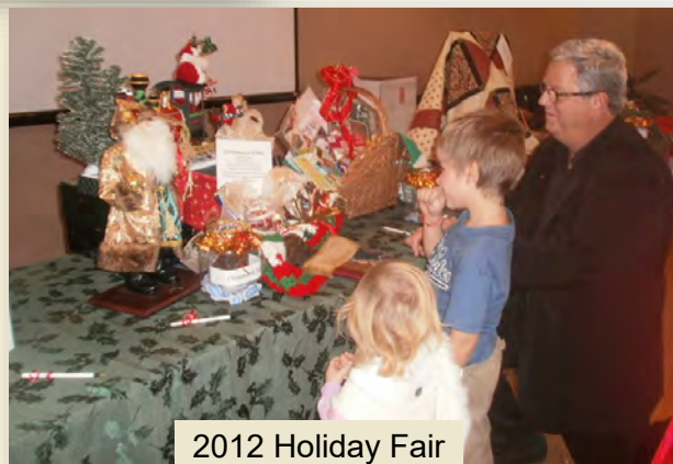
2012 Holiday Fair