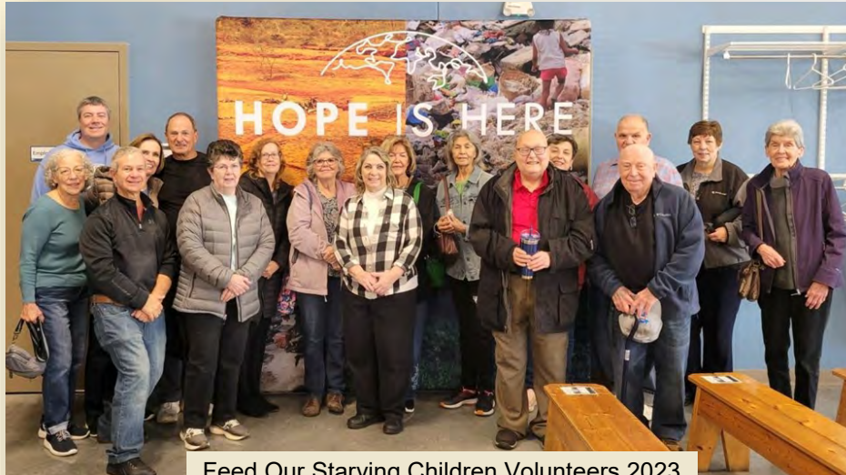
Feed Our Starving Children Volunteers 2023