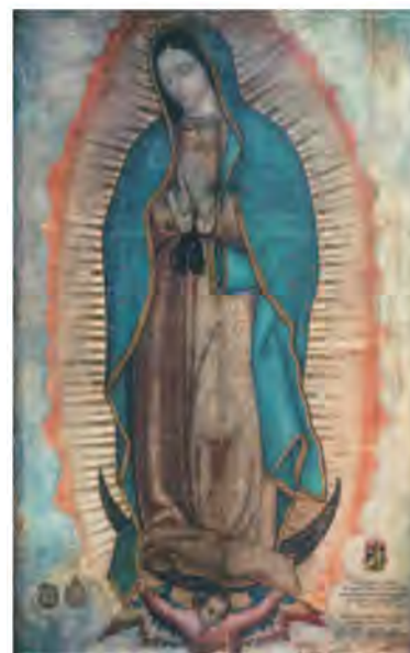
Our Lady of Guadalupe is the Patroness of the unborn, the Americas, and the Knights of Columbus.

Your participation in the Silver Rose program, especially your prayers and pledge for life, are a crucial part of our mission to defend and support life in every stage and condition.