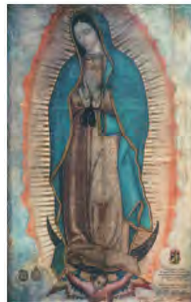
Our Lady of Guadalupe is the Patroness of the unborn, the Americas, and the Knights of Columbus.

Your participation in the Silver Rose program, especially your prayers and pledge for life, are a crucial part of our mission to defend and support life in every stage and condition.