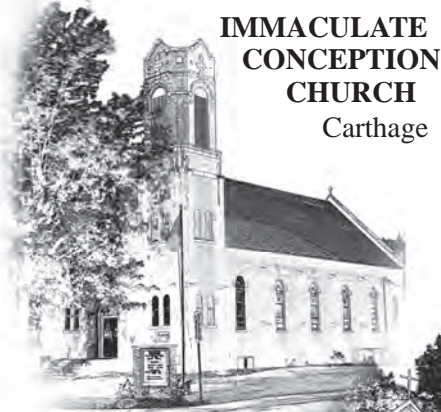
IMMACULATE CONCEPTION CHURCH Carthage