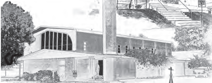
SAINT MARY CHURCH Hamilton