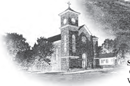
SACRED HEART CHURCH Warsaw

We the Hancock County Catholic Churches, work together to form disciples of Jesus, to lead all to Him in the Eucharist, and to be His presence in the world.