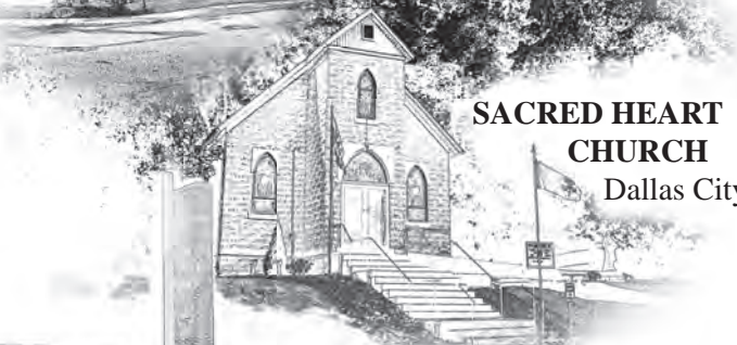
SACRED HEART CHURCH Dallas City