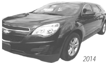
2014 Chevy Equinox SUV 117,000 Miles