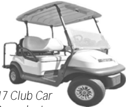
2017 Club Car Precedent Electric Golf Cart