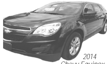
2014 Chevy Equinox SUV 117,000 Miles