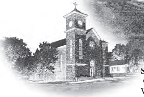
SACRED HEART CHURCH Warsaw

We the Hancock County Catholic Churches, work together to form disciples of Jesus, to lead all to Him in the Eucharist, and to be His presence in the world.