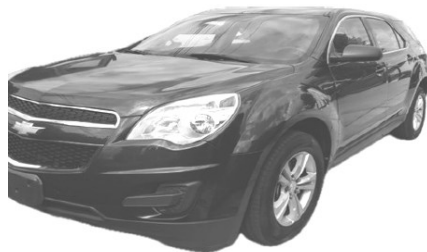
2014 Chevy Equinox SUV 117,000 Miles