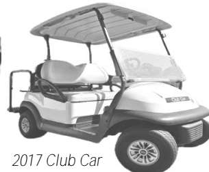
2017 Club Car Precedent Electric Golf Cart