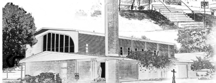
SAINT MARY CHURCH Hamilton