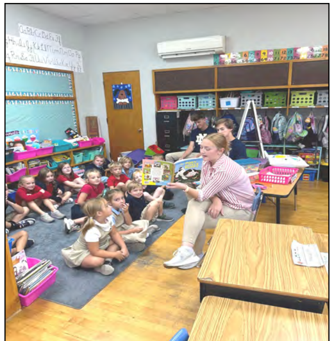
Students from speech class at QND visited St. Francis School recently to read books to students in kindergarten through third grade.