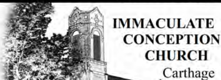
IMMACULATE CONCEPTION CHURCH Carthage