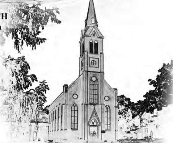
SAINTS PETER & PAUL CHURCH Nauvoo