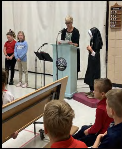
Saint Thérèse of Lisieux