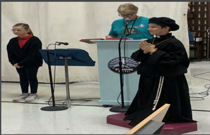
Saint Vincent De Paul