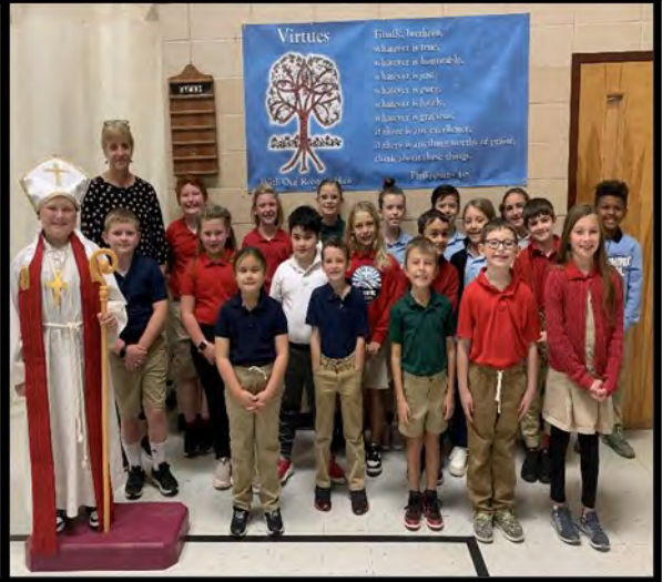
Pope Saint John Paul II