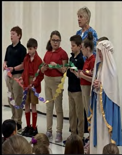
Blessed Virgin Mary