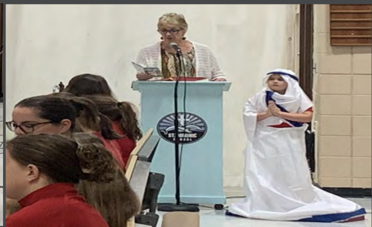
Saint Teresa of Calcutta