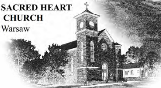
SACRED HEART CHURCH Warsaw