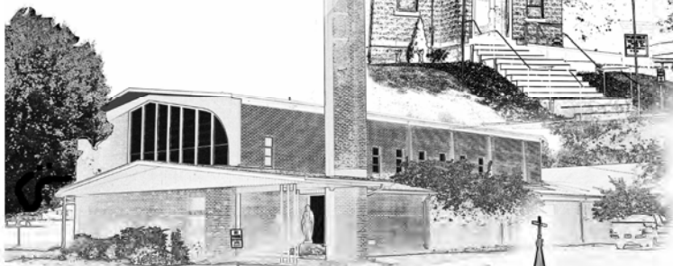
SAINT MARY CHURCH Hamilton