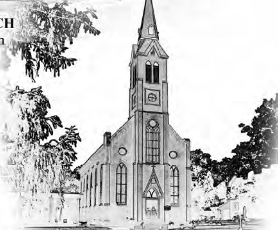
SAINTS PETER & PAUL CHURCH Nauvoo