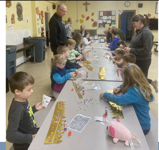
Our Walking with Jesus class celebrates the Feast of Christ the King!!