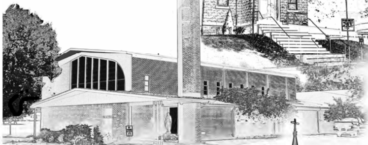
SAINT MARY CHURCH Hamilton