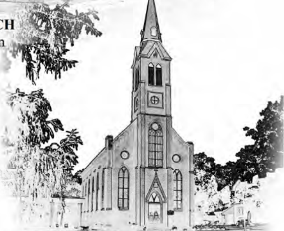
SAINTS PETER & PAUL CHURCH Nauvoo