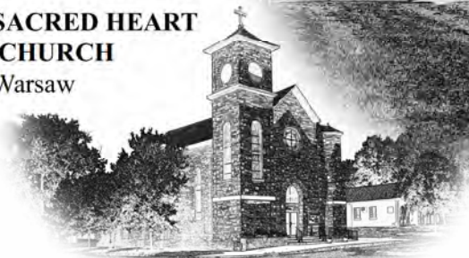
SACRED HEART CHURCH Warsaw