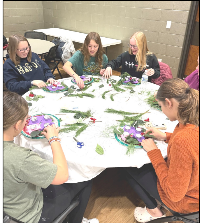
Members of the BEAR youth group made Advent wreaths at one of their recent gatherings.

Who: 6th - 12th grades Where: SFS Parish Hall When: Mondays 7:15 - 8:30