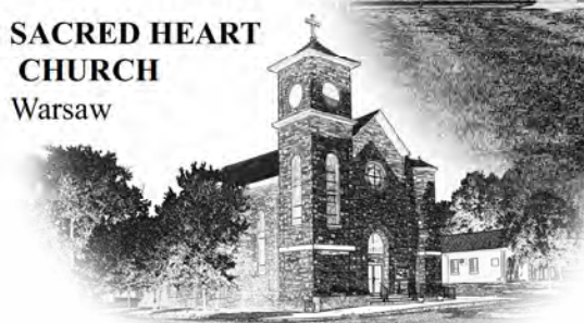
SACRED HEART CHURCH Warsaw