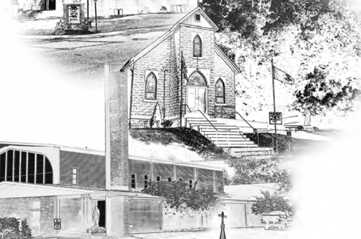
SACRED HEART CHURCH Dallas City