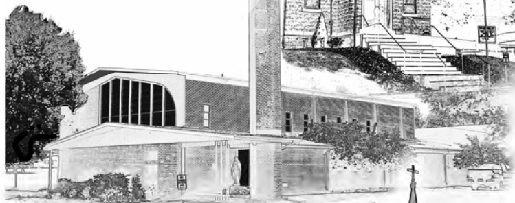
SAINT MARY CHURCH Hamilton