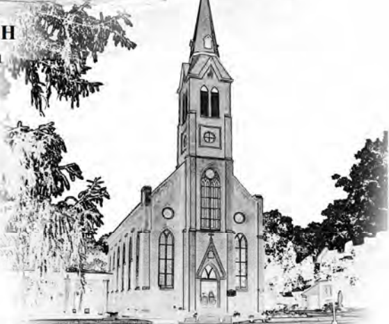
SAINTS PETER & PAUL CHURCH Nauvoo