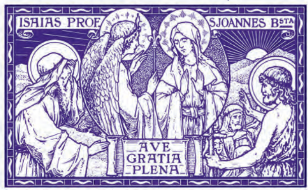
EG NUBES PLUANG JUSGUO