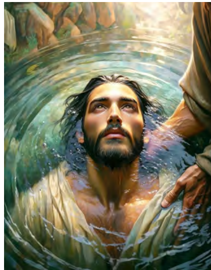
- Genesis 1:2

The voice of the LORD is over the waters, the LORD, over vast waters.