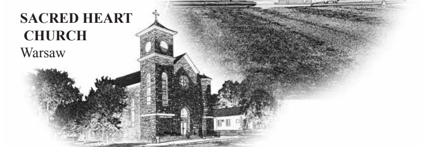
SACRED HEART CHURCH Warsaw