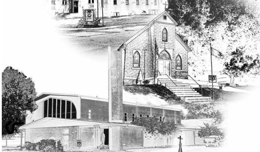
SAINT MARY CHURCH Hamilton