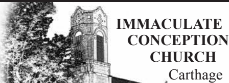
IMMACULATE CONCEPTION CHURCH Carthage