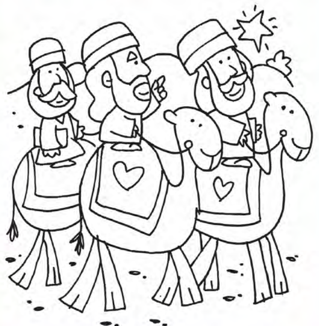
Epiphany of the Lord • Matthew 2:1-12

ei COLOR Read the Gospel of the week and color the image.