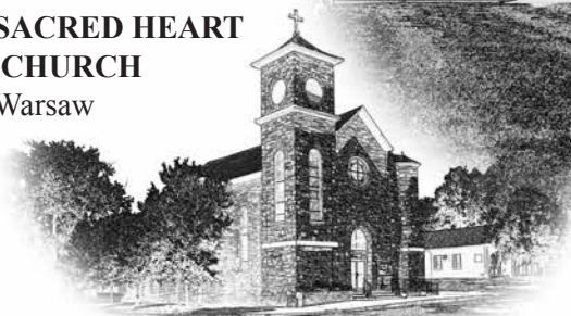
SACRED HEART CHURCH Warsaw