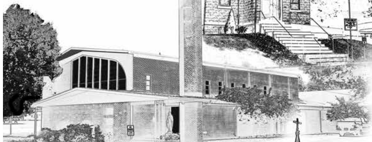
SAINT MARY CHURCH Hamilton