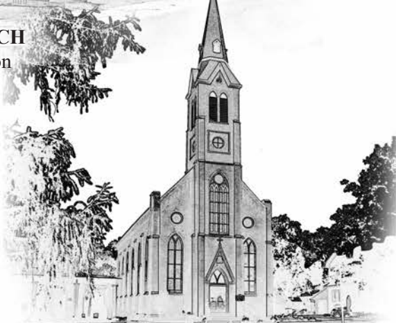
SAINTS PETER & PAUL CHURCH Nauvoo