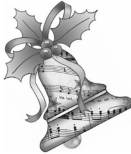
One license #A-730651