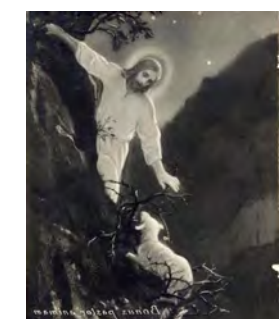
Make sure to participate in the Annual Catholic Appeal! Our parish goal is 100% participation. See Flocknotes for links and how to give.

Peter did not understand that the vision of glory which he was bequeathed was in the future, not the present, and in order to attain it one had to take up a Cross. There were two beats in the Transfiguration: Withdrawal and return. Withdrawal from the present glory for a crucifixion and a return to a greater glory because of it. This momentary detachment from present glory of the Saviour's was not a truancy to duty; it was a withdrawal according to plan to seize the initiative at another time and in another way. - from a 1941 address by Archbishop Fulton Sheen on Peter's attitude at the Transfiguration.