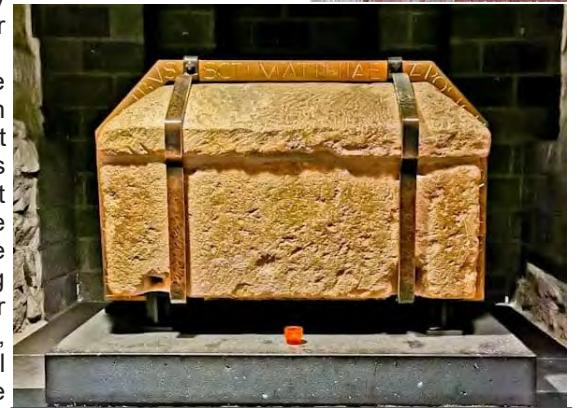
Ossuary of Matthias at St. Matthias Abbey in Trier (Germany)

The election of a pope, along with the selection of other bishops, the ordination of priests and deacons, and the discernment of the many other charisms and ministries in the life of the Church reminds us that the Holy Spirit remains active in the Church, providing more than a mere administrative structure for preaching the Gospel or a simply providing for organizational succession. In every age, the Holy Spirit calls the baptized faithful to witness to the power of Christ alive among us, guiding and forming his flock as disciples and witnesses to the kingdom through the glory of the resurrection.