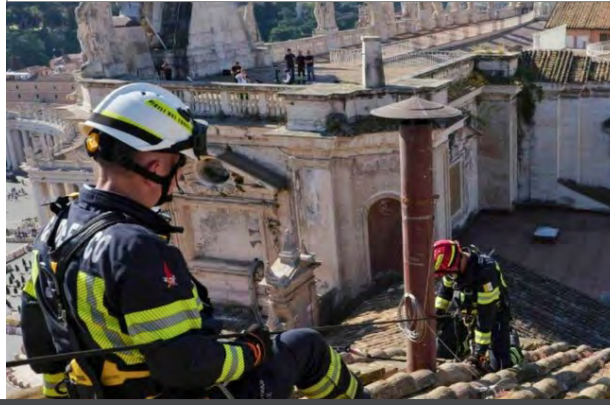
Firefighters installing the chimney over the Sistine Chapel for the conclave in Rome.

As I write today (Wednesday), the cardinals are just now entering the conclave to elect a new pope. The Church throughout the world prays for the outpouring of the Holy Spirit to help us discern and unite behind a shepherd who will witness to the resurrection and lead us after the heart of Christ.