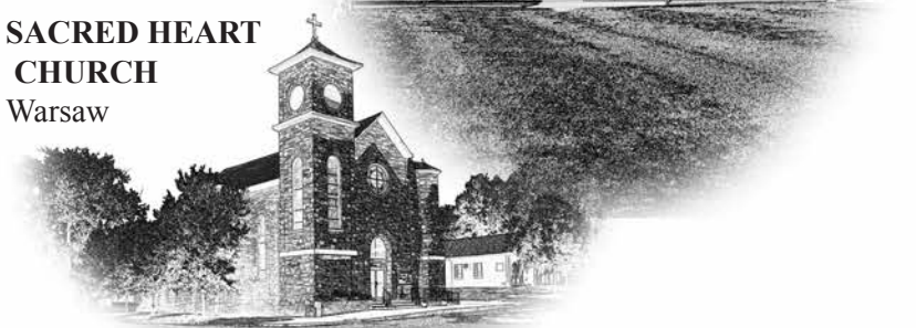
SACRED HEART CHURCH Warsaw