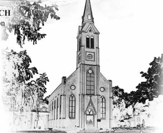
SAINTS PETER & PAUL CHURCH Nauvoo