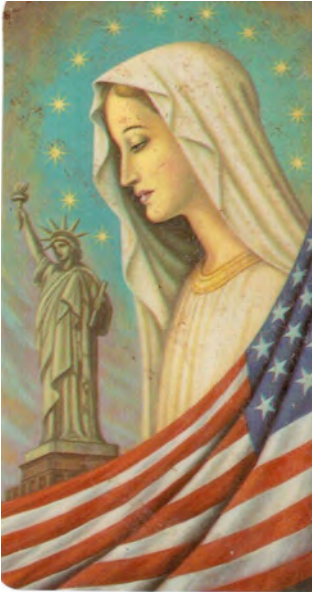
Immaculate Mary, pray for the United States of America!