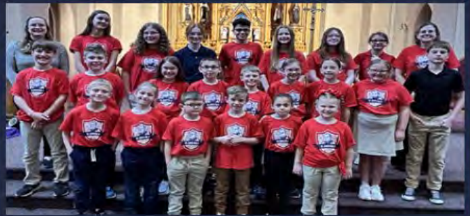
House of Saint Pope John Paul II