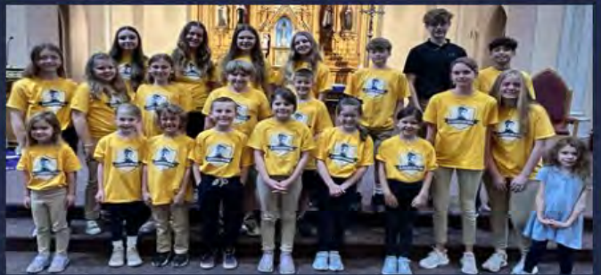
House of Saint Elizabeth Ann Seton