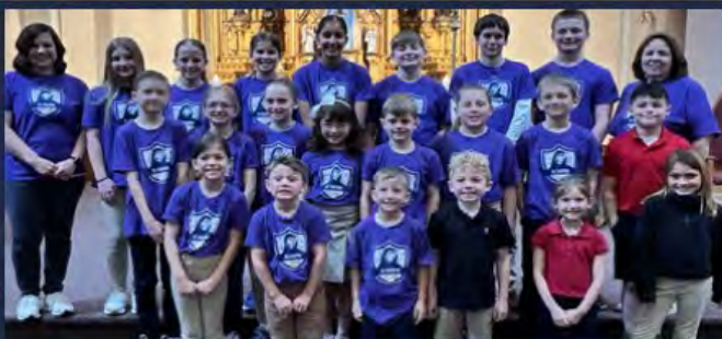
House of Saint Faustina Kowalska