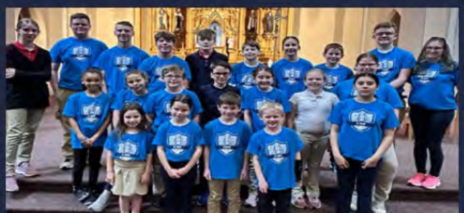
House of Saint Mary