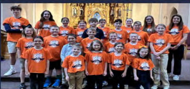
House of Saint Anthony