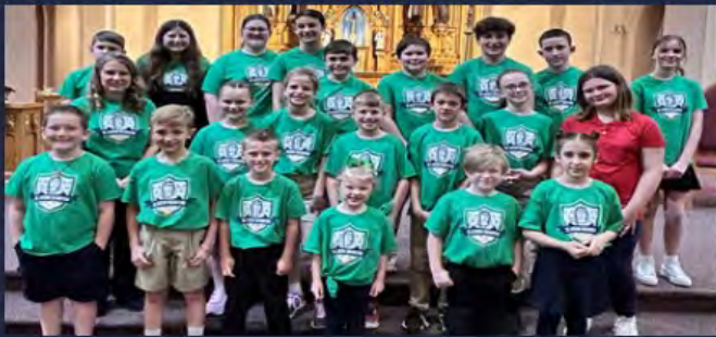
House of Saint Kateri Tekakwitha