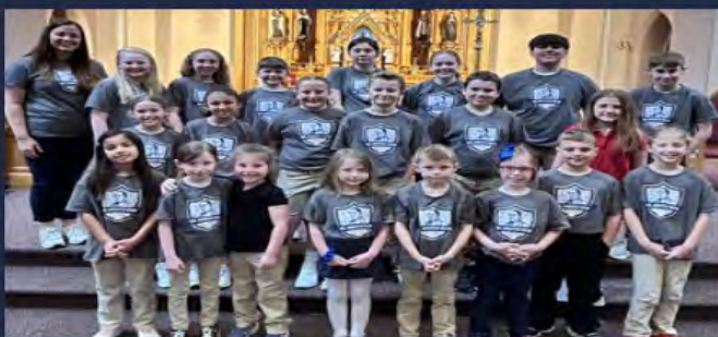
House of Venerable Augustas Tolton