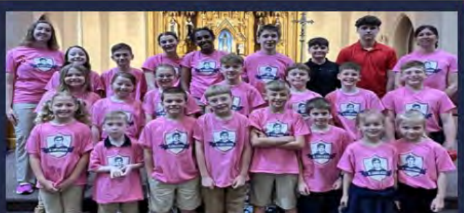
House of Blessed Carlo Acutis