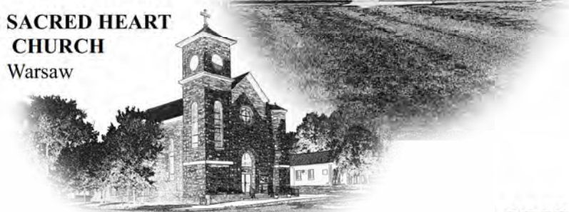
SACRED HEART CHURCH Warsaw