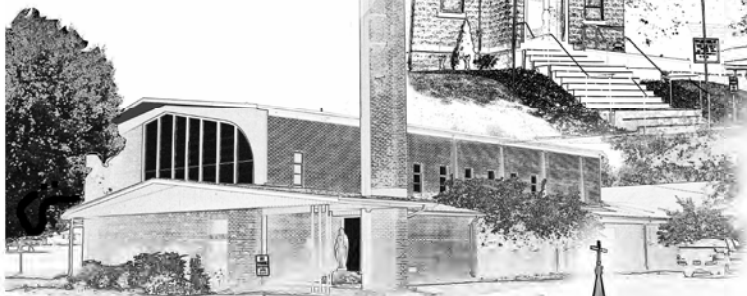
SAINT MARY CHURCH Hamilton