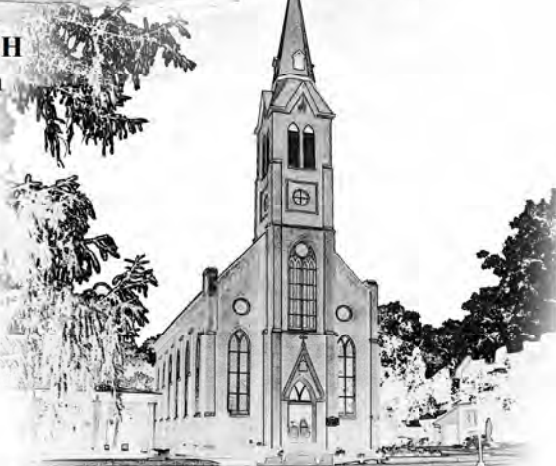
SAINTS PETER & PAUL CHURCH Nauvoo