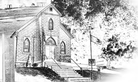
SACRED HEART CHURCH Dallas City