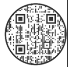
COR Vlog QR Code

The Cor Men's Group challenges all parish families to match our donations to the Last Resources or Food Bank ministries. During 2025, the Cor Men's Group will donate $10 worth of food to the Food Bank in odd-numbered months. We will be donating $10 to Last Resources in even-numbered months. We challenge every parish family to match our donation with a donation of your own.