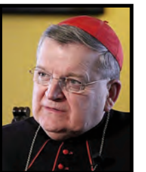
- Cardinal Raymond Burke

If we want to preserve the common good in society it is extremely important that good generous members of the lay faithful become active in politics.