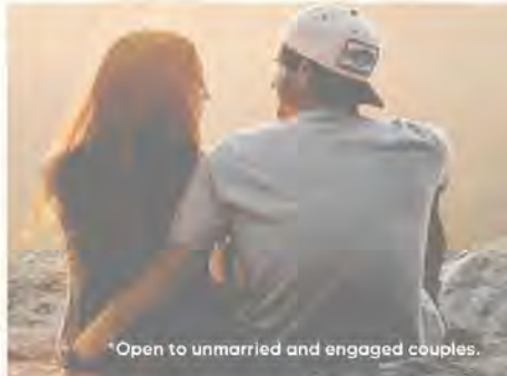
*Open to unmarried and engaged couples.

Mid-life Singles: Are you looking for a renewed sense of purpose & belonging? Register today for a life-changing REFLECT weekend retreat at the Pallottine Renewal Center, Florissant, MO (30 min from downtown St. Louis), on August 15-17, 2025. Take a chance and get involved... you won't regret it! Cost is $290 including meals. Visit www.ReflectRetreat.com , or e-mail reflect.stlouis@gmail.com , or call (630) 222-8303 for details.