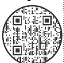
COR Vlog QR Code

The Cor Men's Group challenges all parish families to match our donations to the Last Resources or Food Bank ministries. During 2025, the Cor Men's Group will donate $10 worth of food to the Food Bank in odd-numbered months. We will be donating $10 to Last Resources in even-numbered months. We challenge every parish family to match our donation with a donation of your own.