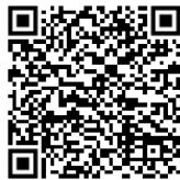
IRS on RMD's