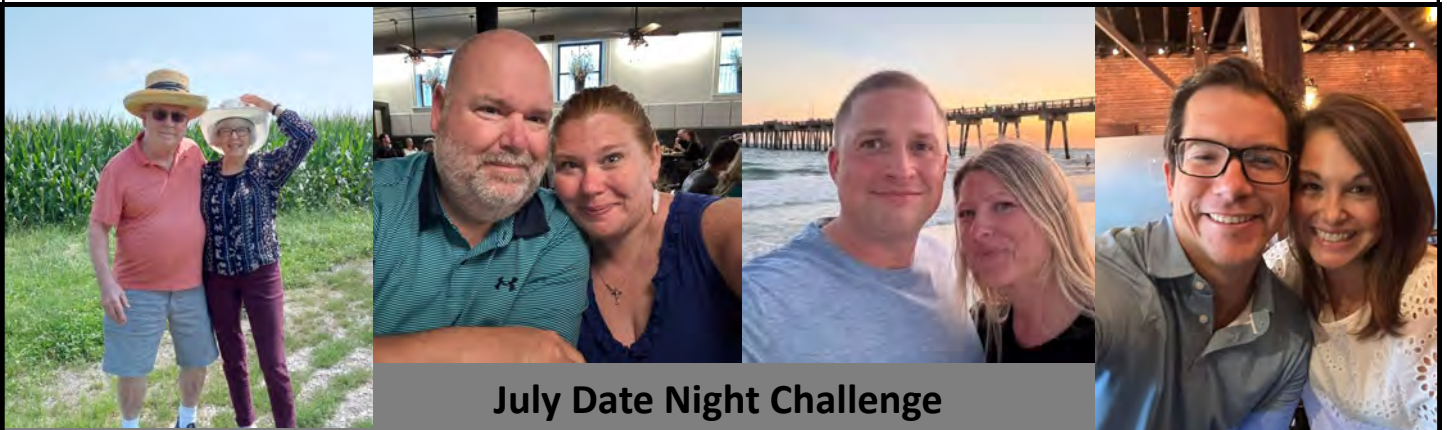
July Date Night Challenge

Our cultural standards are different from God's standards. We often rank people by what they have, how powerful they are, or how successful they are. Jesus reminds us that God will not judge us by the same earthly standards. When God asks you, "What have you done with the gifts I have given you?", how will you respond?