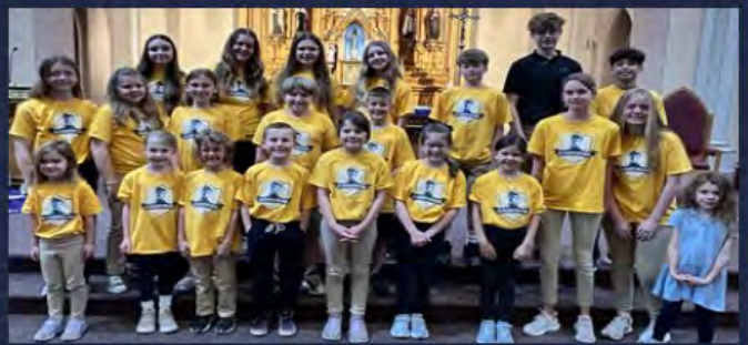
House of Saint Elizabeth Ann Seton