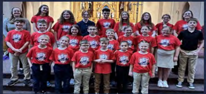
House of Saint Pope John Paul II