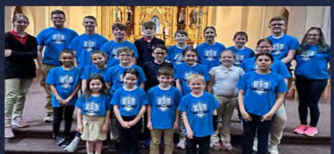
House of Saint Mary