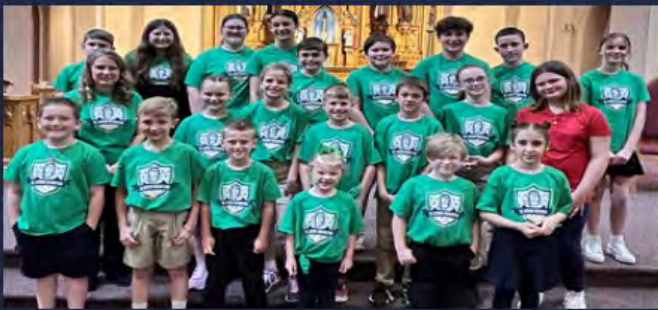
House of Saint Kateri Tekakwitha