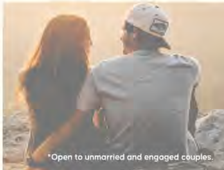
*Open to unmarried and engaged couples.

Mid-life Singles: Are you looking for a renewed sense of purpose & belonging? Register today for a life-changing REFLECT weekend retreat at the Pallottine Renewal Center, Florissant, MO (30 min from downtown St. Louis), on August 15-17, 2025. Take a chance and get involved... you won't regret it! Cost is $290 including meals. Visit www.ReflectRetreat.com , e-mail reflect.stlouis@gmail.com , or call (630) 222-8303 for details.