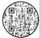
COR Vlog QR Code

The Cor Men's Group challenges all parish families to match our donations to the Last Resources or Food Bank ministries. During 2025, the Cor Men's Group will donate $10 worth of food to the Food Bank in odd-numbered months. We will be donating $10 to Last Resources in even-numbered months. We challenge every parish family to match our donation with a donation of your own.