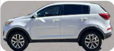
2015 Kia Sportage LX SUV (2.4 Liter)

RAFFLE TICKETS FOR 2015 KIA SUV & YANAGA GOLF CART + Other Cash Prizes