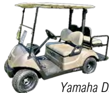
Yamaha Drive Fuel Injected Gas EFI Street Worthy Golf Cart

$25 per Ticket or 5 Tickets for $100 You do not need to be present to WIN!