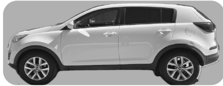
2015 Kia Sportage LX SUV (2.4 Liter)

RAFFLE TICKETS FOR 2015 KIA SUV + Other Cash Prizes