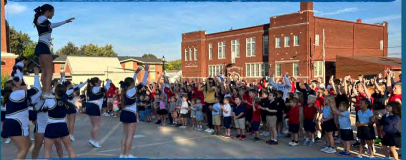
BSCS Alumni in the QND Raider Roadshow