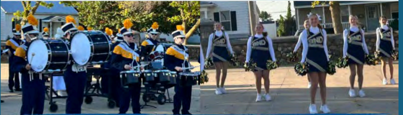
2025 QND Raider Roadshow at BSCS