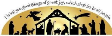
Christmas Mass Schedule

December 31: Mass at 4:00 p.m. January 1: Mass at 9:00 a.m.