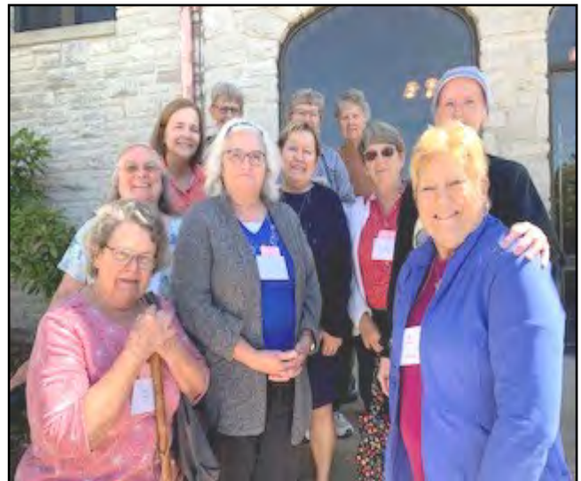
These women attended the Women's White House Retreat in St. Louis as part of the Fall retreat.

The Ladies of St. Francis wish everyone a Happy New Year!