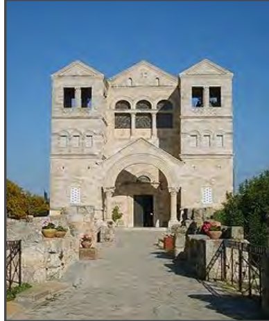
Church of the Transfiguration on Mt. Tabor in Israel

Every second Sunday in Lent, we hear a Gospel account of the Transfiguration of the Lord. In this event, Jesus revealed his glorified body to Peter, James, and John. The disciples' response seems rather puzzling, though: "Let us build three tents (or 'huts'): one for you, one for Moses, and one for Elijah." It seems disciples were seeking a moment to rest in this amazing encounter and have a place—a destination—where they and others could come to see the Lord and these revered prophets. In a way, this was a first step in 'capturing' the religious experience to a specific place or a specific time so that they could come back and draw strength from it later. In a way, the disciples were asking Jesus if they could build the first church on that mountaintop site.