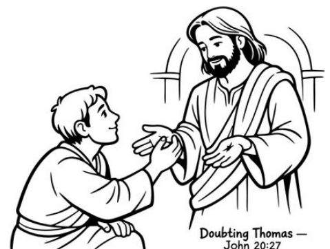
Doubting Thomas — John 20:27

For our sake he was crucified under Pontius Pilate, he suffered death and was buried, and rose again on the third day in accordance with the Scriptures. He ascended into heaven and is seated at the right hand of the Father. He will come again in glory to judge the living and the dead and his kingdom will have no end. I believe in the Holy Spirit, the Lord, the giver of life, who proceeds from the Father and the Son, who with the Father and the Son is adored and glorified, who has spoken through the prophets. I believe in one, holy, catholic and apostolic Church. I confess one Baptism for the forgiveness of sins and I look forward to the resurrection of the dead and the life of the world to come. Amen