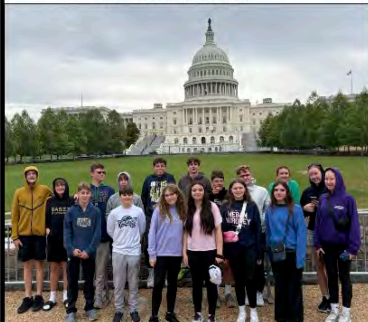
The Capitol Building