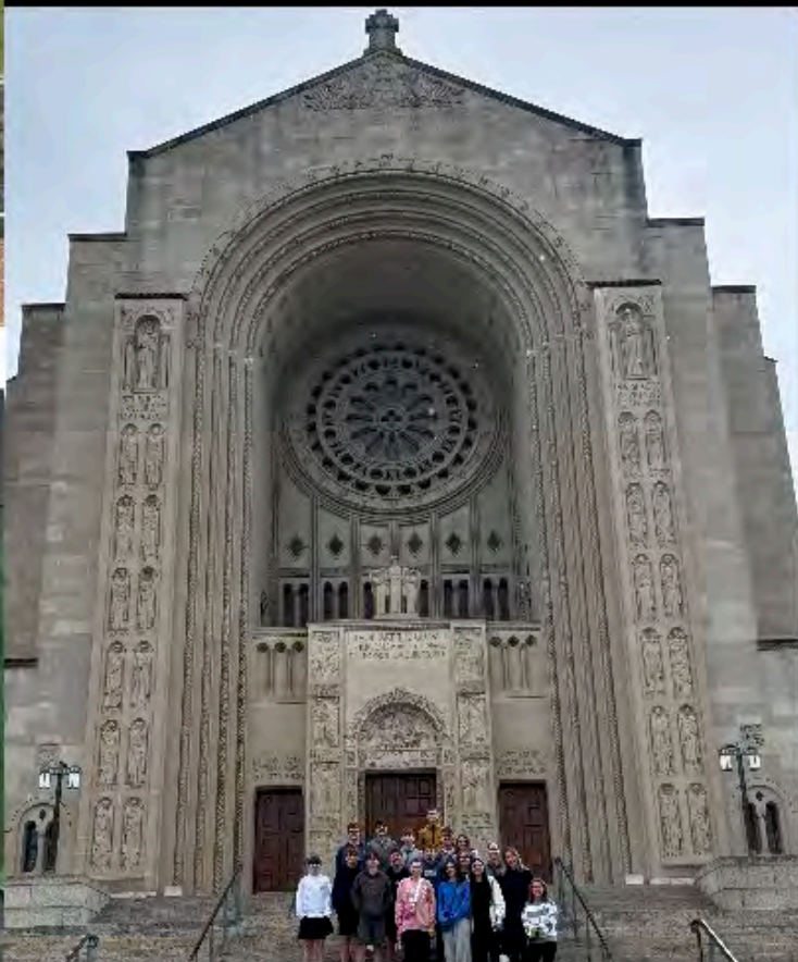
Basilica of the National Shrine of the Immaculate Conception