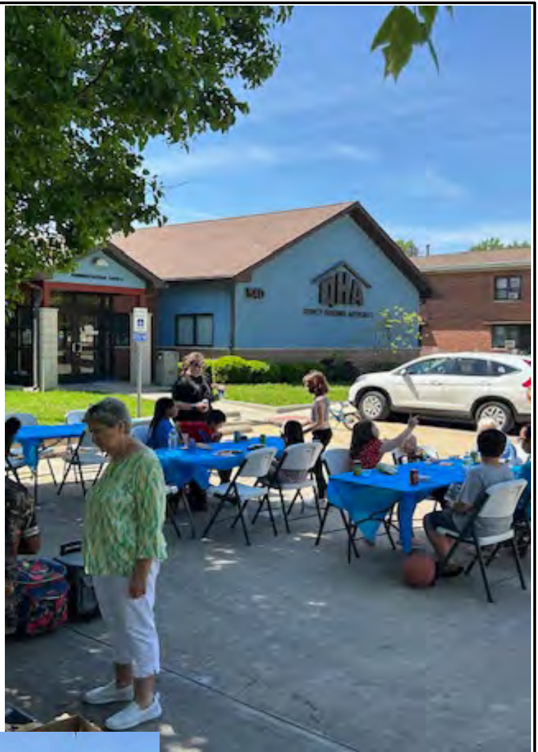
Members of Blessed Sacrament's St. Vincent DePaul Society showing love to all of the residents who live at Harrison Hills by serving a free lunch!