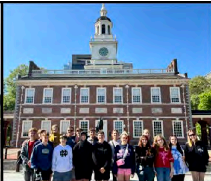
Independence Hall, Philadelphia