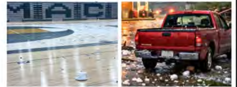
Kankakee County Storm Damage 3/10/26